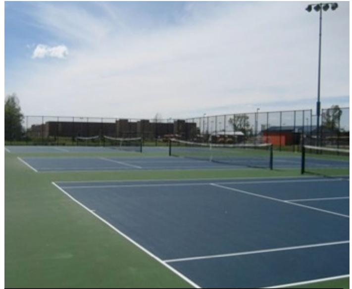
Fenton high school's new tennis facility has eight courts. The Tigers won or shared 12 of the first 19 Metro League tournaments, including a string of seven in a row from 1977-83.

**Holly went undefeated in Metro duals and won the league tournament to capture the Metro title. After the tournament was played, Holly was forced to forfeit the league tournament and the Metro championship because of a controversial eligibility issue at the tournament.